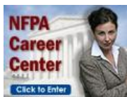
NFPA Career Center